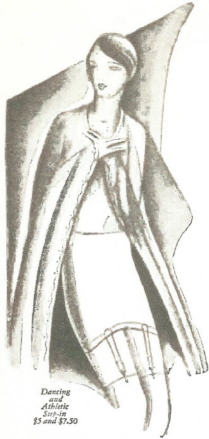
Dancing and Athletic Step-in $5 and $7.50